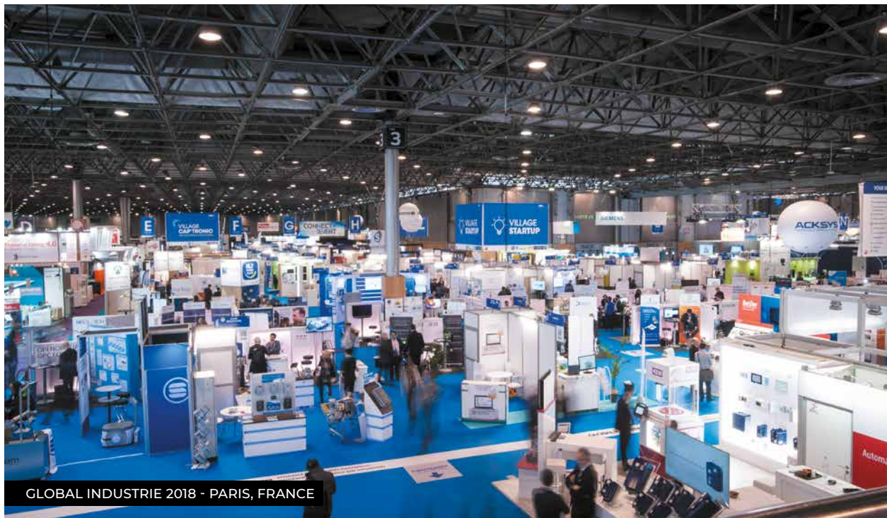
GLOBAL INDUSTRIE 2018 - PARIS, FRANCE

For the first time, GL events participated in China's No. 1 import-themed exhibition, an event that attracted more than 3,800 exhibitors and over 500,000 domestic and overseas trade visitors. GL events obtained a number of leads ranging from opportunities to develop and operate new sites, services for large international events to the launching of new events in China.