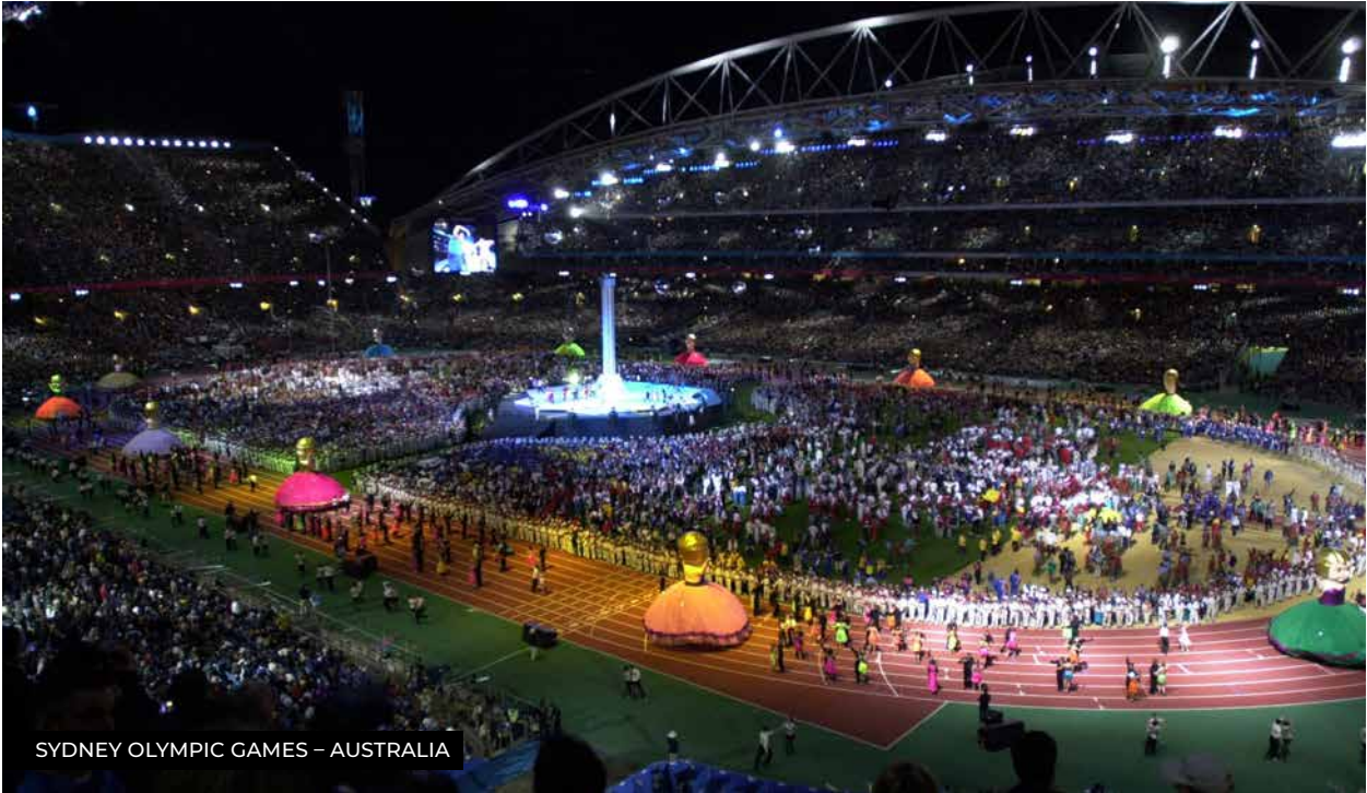
SYDNEY OLYMPIC GAMES – AUSTRALIA